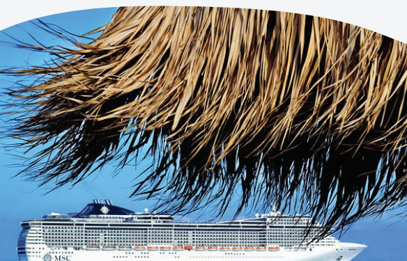
MSC CRUISES, PERFECT FOR COUPLES

Article Source: [ http://EzineArticles.com/?A-Cruise---The-Perfect-Couples-Romantic-Getaway&id=984766 ] A Cruise - The Perfect Couples' Romantic Getaway